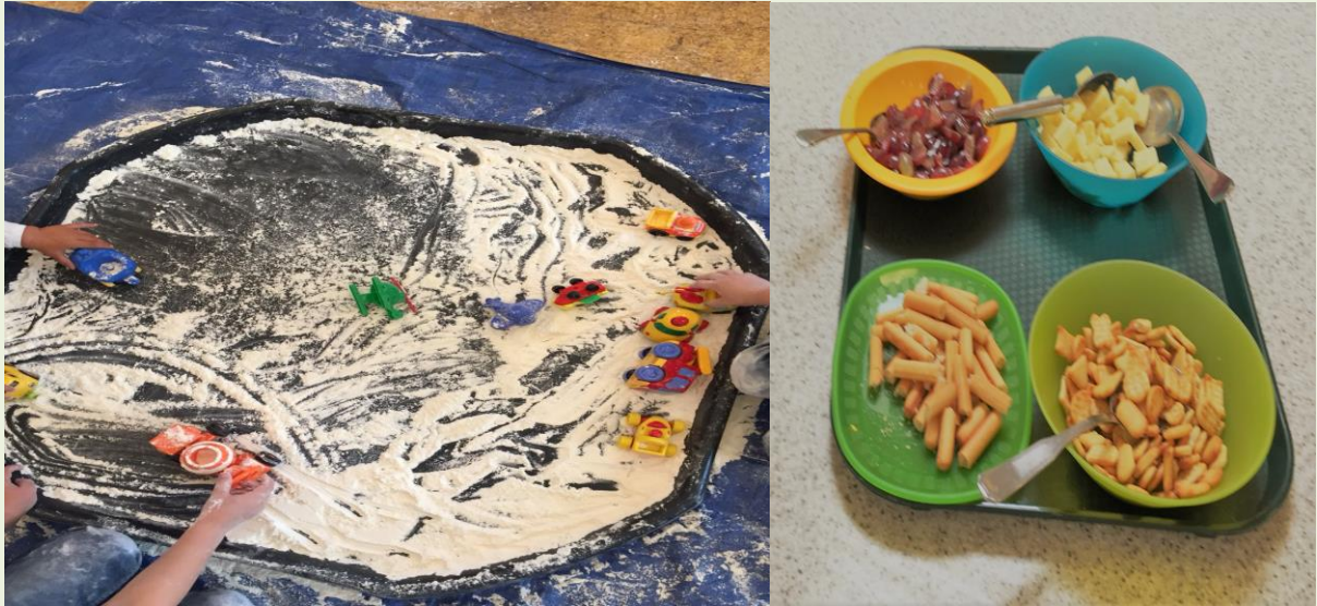
GRoW, Parish Church St John the Baptist, Grove

“We see 60+ families every week across all our sessions. We have contact with 200 families at our Bumps & Beyond sessions.”