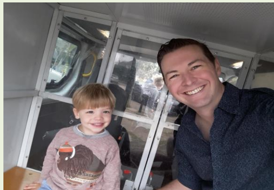
HBC SuperDads, Oxford

"My kids love coming here – they think it's even better than the Children's Centres we used to go to."