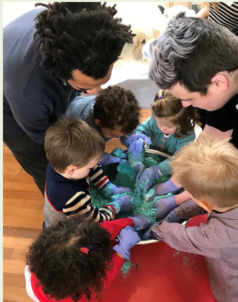
HBC SuperDads (sessions for male carers), Headington, Oxford

“A total of more than 49 families with 62 children (age range from 3 months to 8 years; median 2.5), have joined in this first year.”